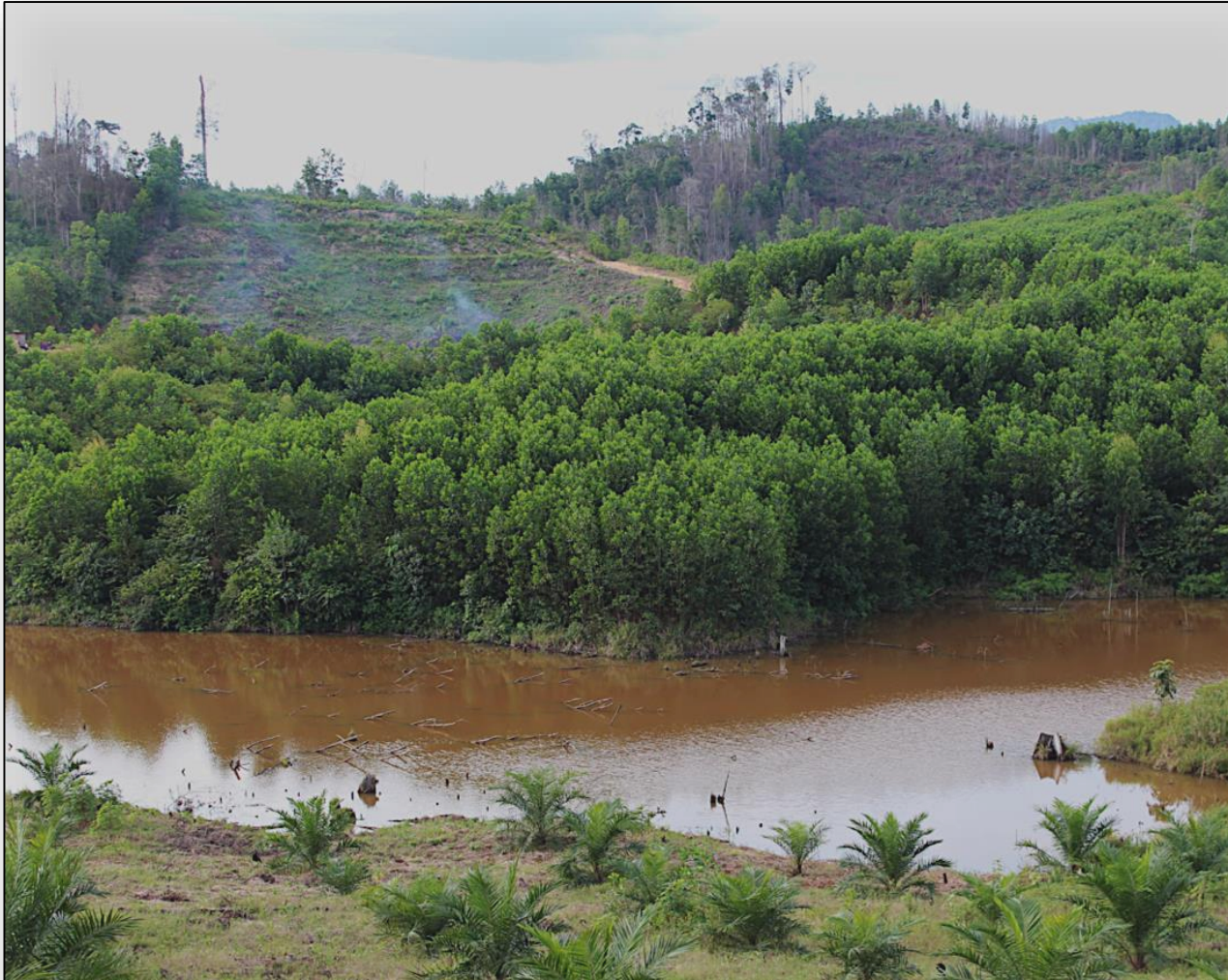
Bukit Tigapuluh, Jambi (Indonesië)